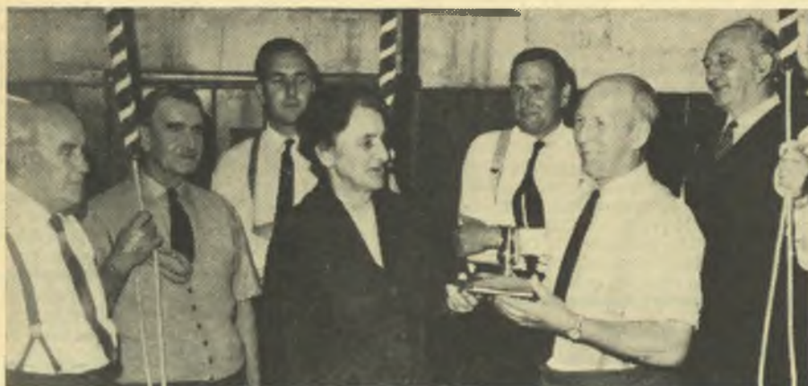
Bath and Wells Association. Presentation at Yeovil.

Additional copies over 4. £3 0 0 (3.00) each. Overseas to follow.