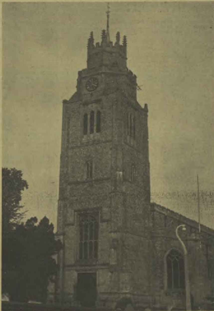
St. Andrew's, Sutton-in-the-Isle.