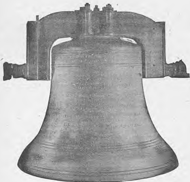
SHERBORNE ABBEY RECAST TENOR.