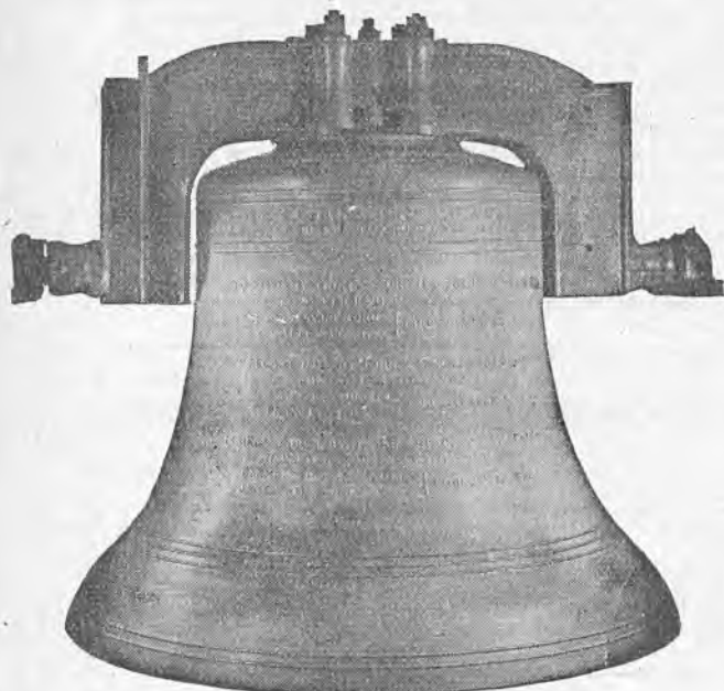
SHERBORNE ABBEY RECAST TENOR.