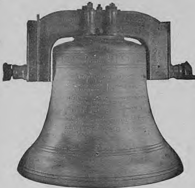
SHERBORNE ABBEY RECAST TENOR. 45 cwt. 0 qr. 5 lb.