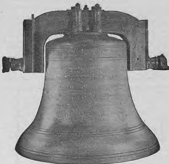
SHERBORNE ABBEY RECAST TENOR.