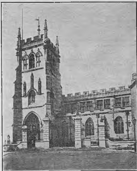
ST. MARY'S CHURCH, KIDDERMINSTER.