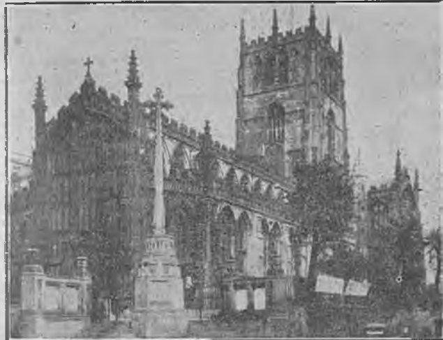
ST. MARY'S CHURCH, NOTTINGHAM.

4th.—As the 3rd, except for Latin pentameter: 'Untouched, I silent am; strike, and I sweetly sing.'