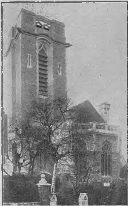
The New Tower at Addiscombe Parish Church.

The bell, of which we gave an illustration last week, is one of the largest and certainly one of the finest in Surrey. It weighs over two and a half tons, and its deep, sonorous tones are a delight to the ear. It is the gift of a generous member of the congregation.