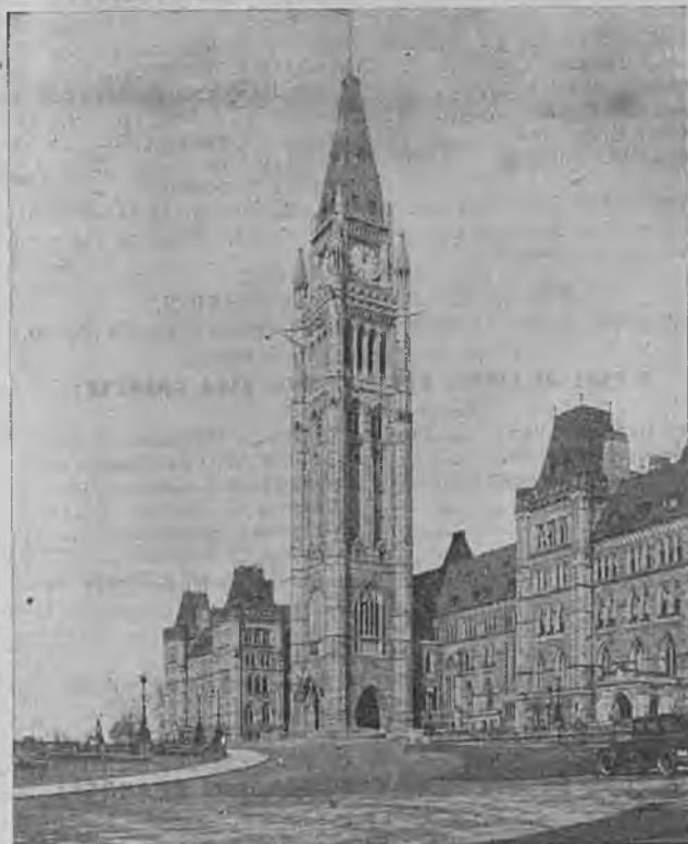
THE VICTORY TOWER Height 300 feet