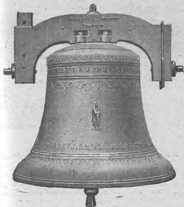
The 30 cwt. Tenor of the Ring of 10 at St. Peter's, Croydon.