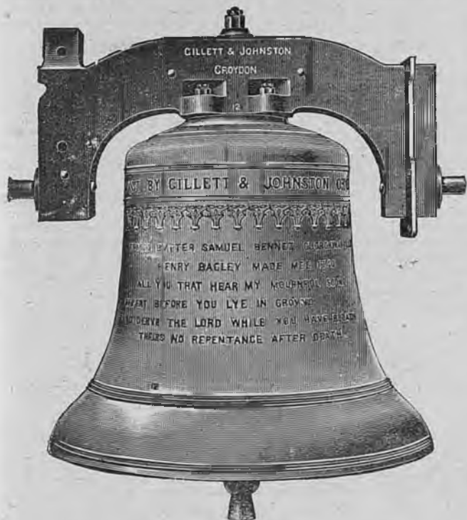
St. Peter's Collegiate Church, Wolverhampton. Tenor (33 cwt.) of the New Ring of 12

WULFRUN CHAMBERS, WOLVERHAMPTON, MESSRS. GILLET and JOHNSTON, CROYDON, 4th March, 1912. Gentlemen,