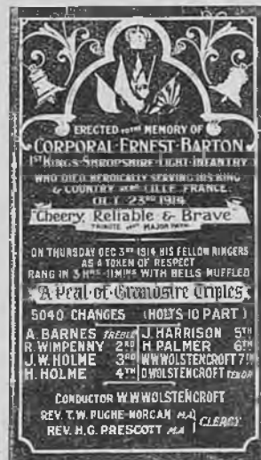
THE MEMORIAL TABLET.

Afterwards touches were rung on the bells, the local band and the ringers of the Parish Church taking part. Their operations were watched with interest by many of the visitors who had not been into a belfry before.