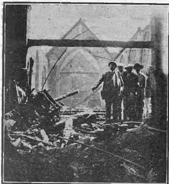
THE RUINS AT WARGRAVE.

The accompanying pictures vividly illustrate the devastation caused, it is believed, by suffragettes at Breadsall (Derbyshire) and Wargrave (Berks) Churches. In each