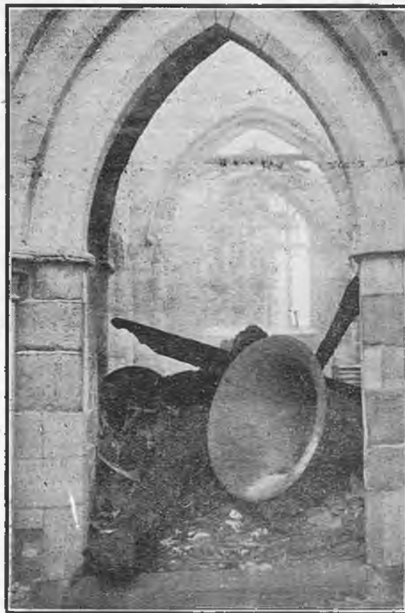
THE DEVASTATION AT BREADSALL.

There were five bells at Breadsall, with a tenor of about 10 cwt. The fourth was dated 1768. The cracked tenor