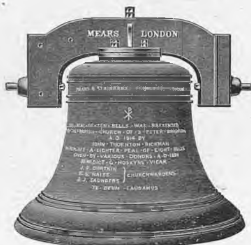
Tenor Bell, 25½ cwt., of the new ring of Ten at St. Peter's, Brighton.