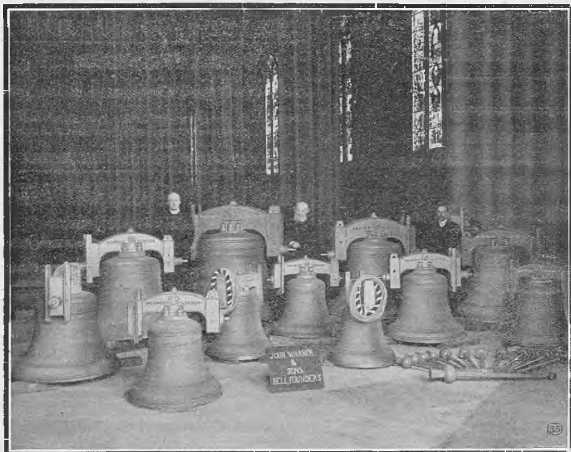
THE BISHOP OF SHEFFIELD AND THE DEAN OF YORK AND YORK MINSTER BELLS, 1914.