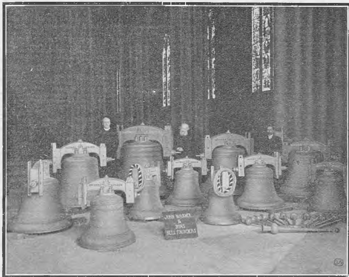
THE BISHOP OF SHEFFIELD AND THE DEAN OF YORK AND YORK MINSTER BELLS, 1914.

MESSRS. JOHN WARNER & SONS, LTD., THE SPITALFIELDS BELL FOUNDRY, LONDON, E.