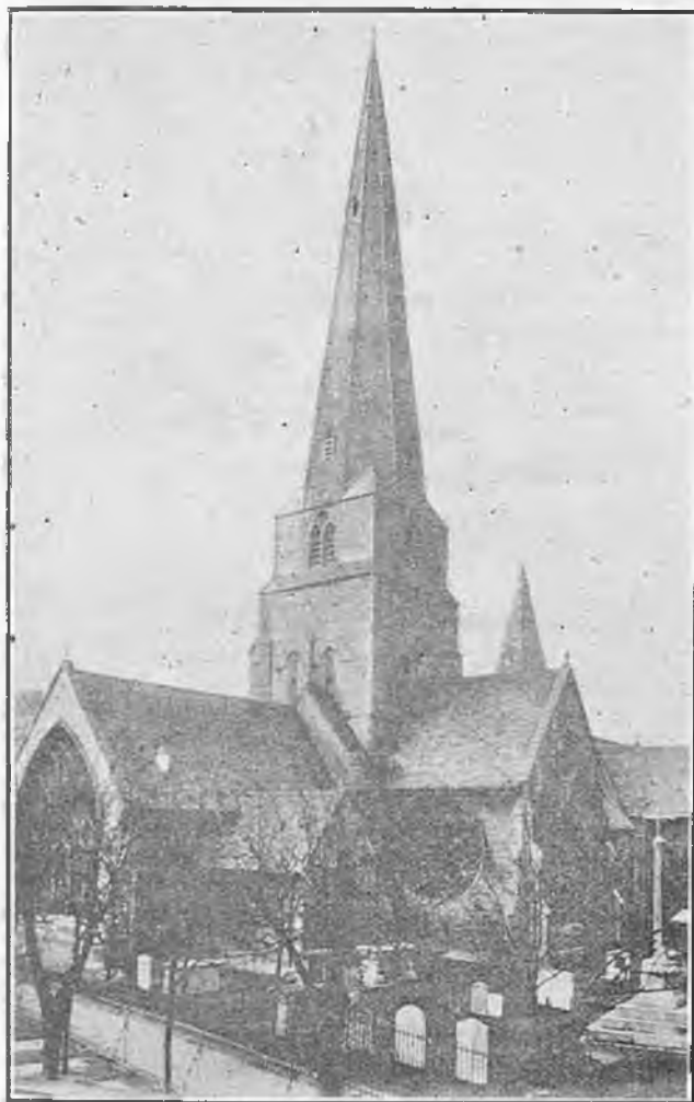
CHELTENHAM PARISH CHURCH.

The other day we recorded the first peal on the twelve bells of Cheltenham Parish Church—a peal of Grandsire Cinques. Such a performance is of more than passing interest, and serves to recall some noteworthy achievements in this tower. Originally the peal of four or five bells there were recast by Rudhall, of Gloucester, into a peal of eight, the tenor being 22 cwt. 2 qrs. 16 lbs. in E flat. In 1826 and onwards various peals of Grandsire (including