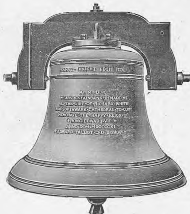
THE TENOR BELL, SOUTHWARK CATHEDRAL, Weight, 50 cwt, 0 qr. 21 lbs.

Bellfounders & Bellhangers, 32 & 34, Whitechapel Road, LONDON, E.