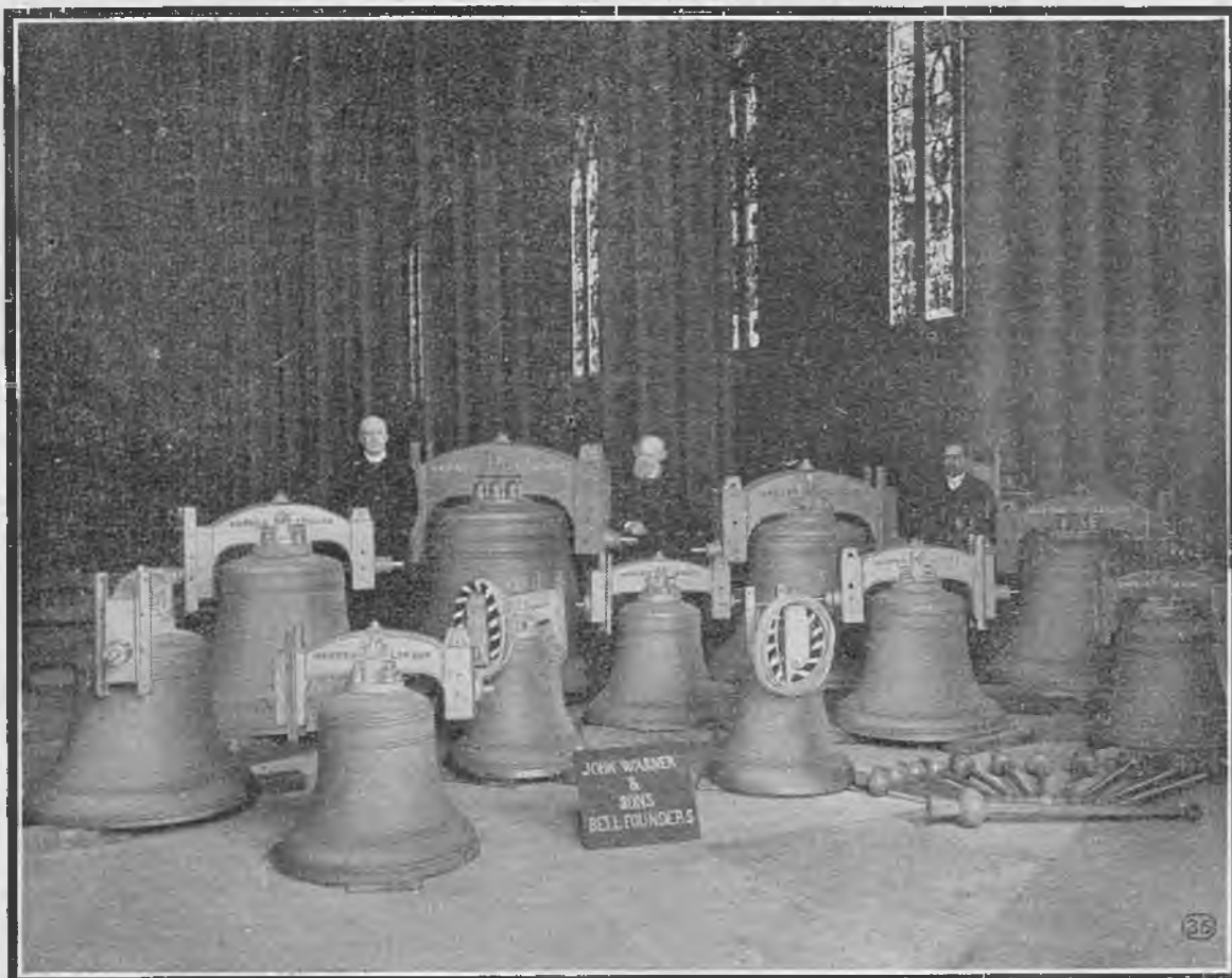
THE BISHOP OF SHEFFIELD AND THE DEAN OF YORK AND YORK MINSTER BELLS, 1914.

MESSRS. JOHN WARNER & SONS, LTD., THE SPITALFIELDS BELL FOUNDRY, LONDON, E.