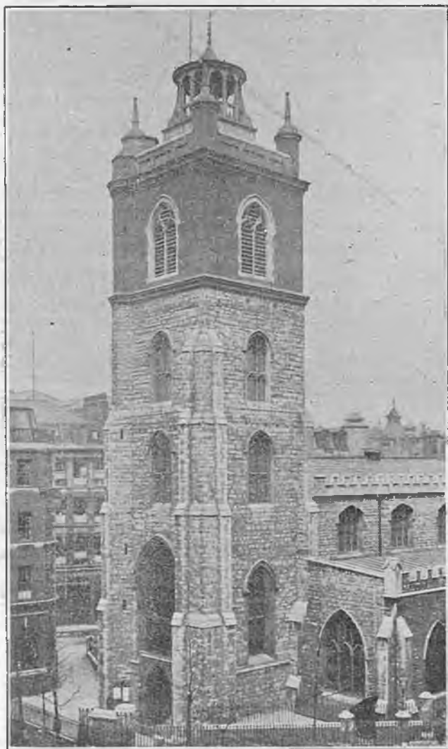
ST. GILES', CRIPPLEGATE.