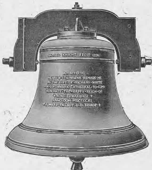
THE TENOR BELL. SOUTHWARK CATHEDRAL, Weight. 50 cwt. 0 qr. 21 lbs.

Bellfounders & Bellhangers, 32 & 34, Whitechapel Road, LONDON, E.