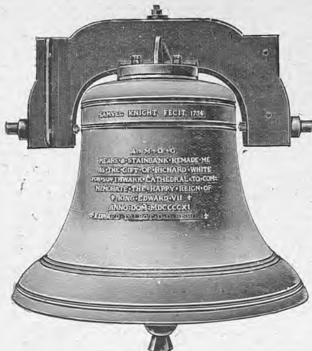
THE TENOR BELL, SOUTHWARK CATHEDRAL, Weight. 50 cwt, 0 qr. 21 lbs.

Bellfounders & Bellhangers, 32 & 34, Whitechapel Road, LONDON, E.