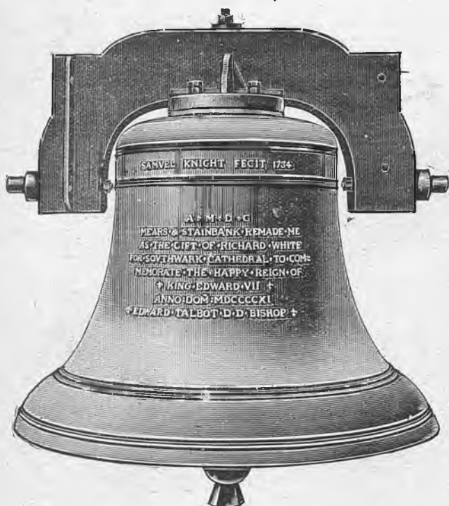
THE TENOR BELL, SOUTHWARK CATHEDRAL. Weight. 50 cwt, 0 qr. 21 lbs.

Bellfounders & Bellhangers, 32 & 34, Whitechapel Road, LONDON, E.