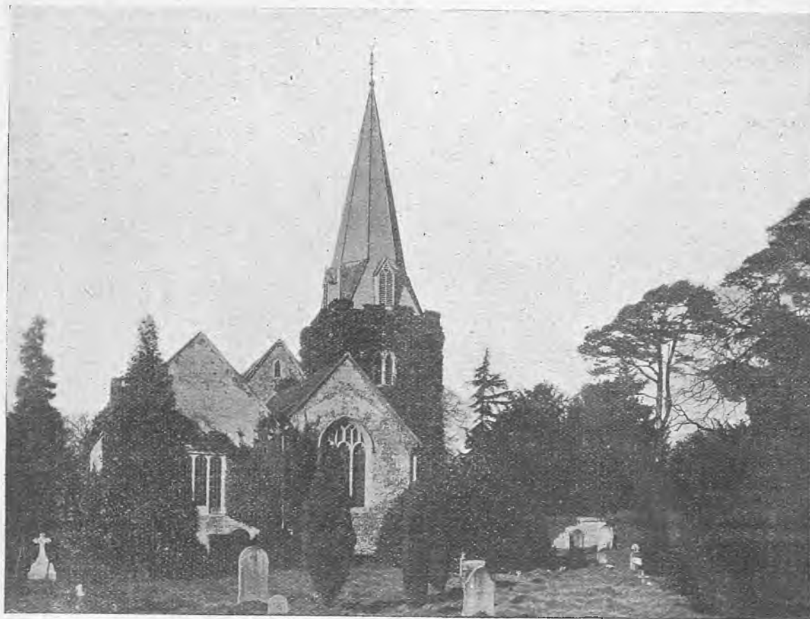
A Famous Church where the bells have just been re-cast and re-hung by Messrs. Gillett & Johnson, of Croydon.