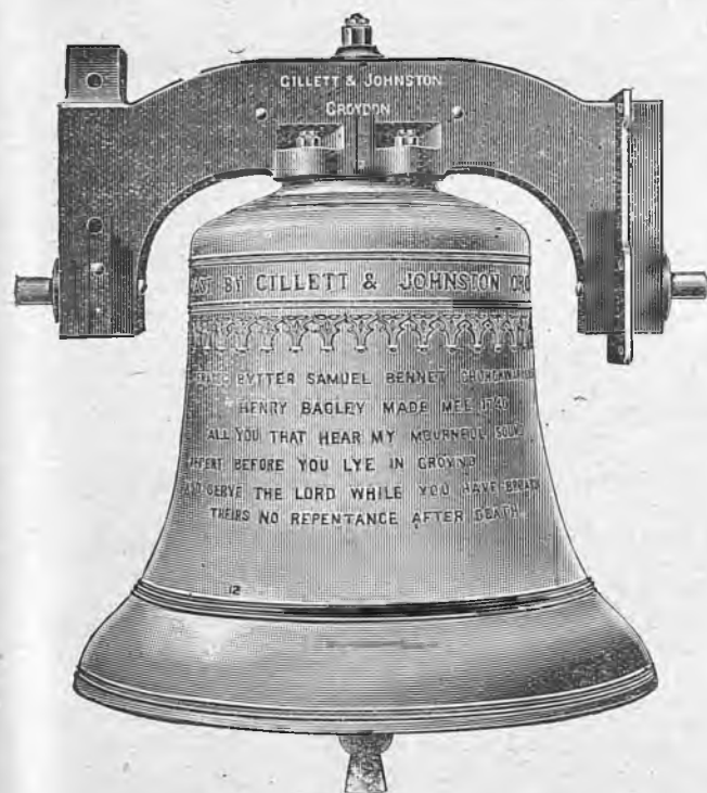
St. Peter's Collegiate Church, Wolverhampton. Tenor (33 cwt.) of the New Ring of 12.