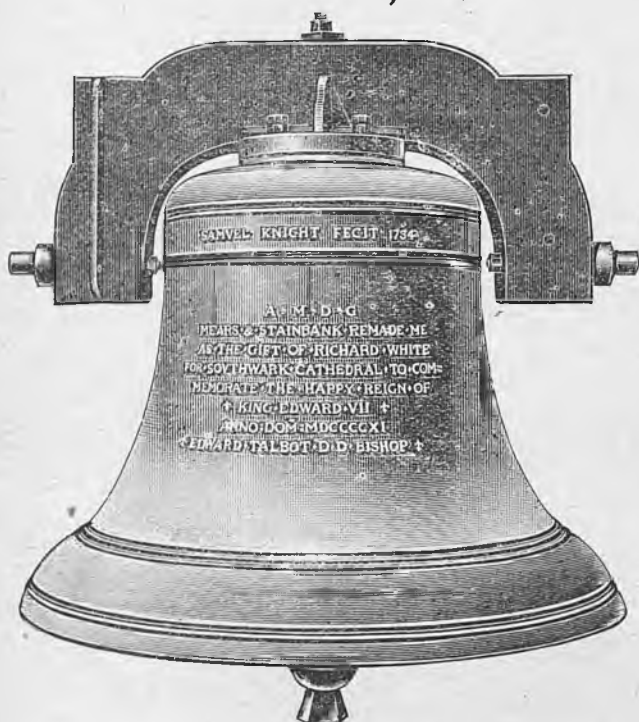
THE TENOR BELL, SOUTHWARK CATHEDRAL, Weight, 50 cwt. 0 qr. 21 lbs.

Bellfounders & Bellhangers, 32 & 34, Whitechapel Road, LONDON, E.