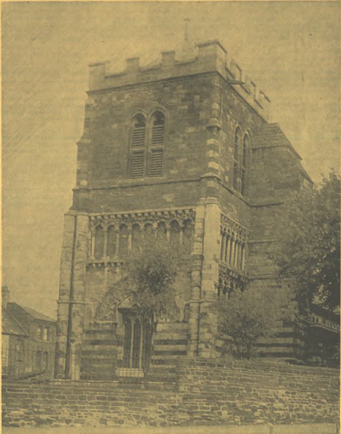
ST. PETER'S CHURCH, NORTHAMPTON