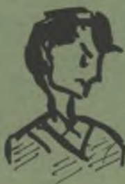
WHAT DOES THE IDIOT THINK HE'S RINGING? STEDMAN?