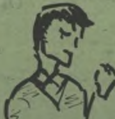
SOME FOOL'S MISSED HIS 3-4 DOWN, SURELY