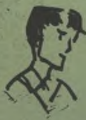
HIT OF A SCUFFLE AMONG THE LITTLE BELLS