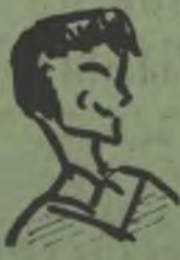
A TRIFLING INDISCRETION, TREBLES WILL BE TREBLES