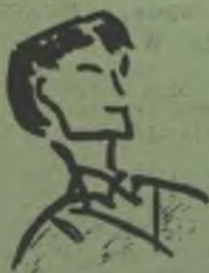
VERY FAIR BOB MAJOR YES, INDEED