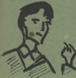
TREBLE SHOULD BE AT THE BACK BY NOW