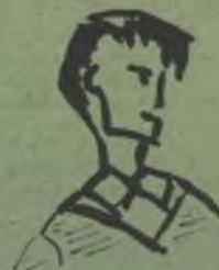
NO, NO, THEY'RE STRAIGHTENING OUT