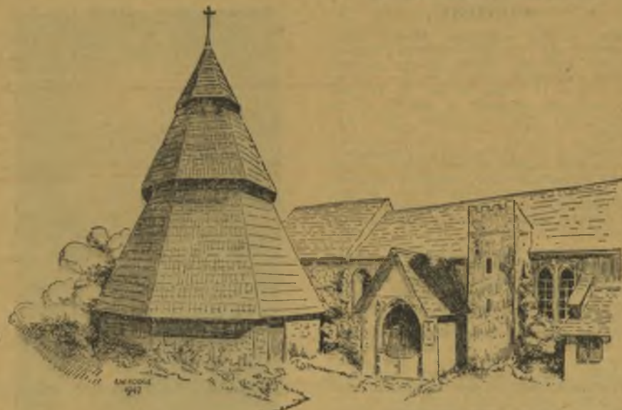
S. AUGUSTINE'S CHURCH BROOKLAND