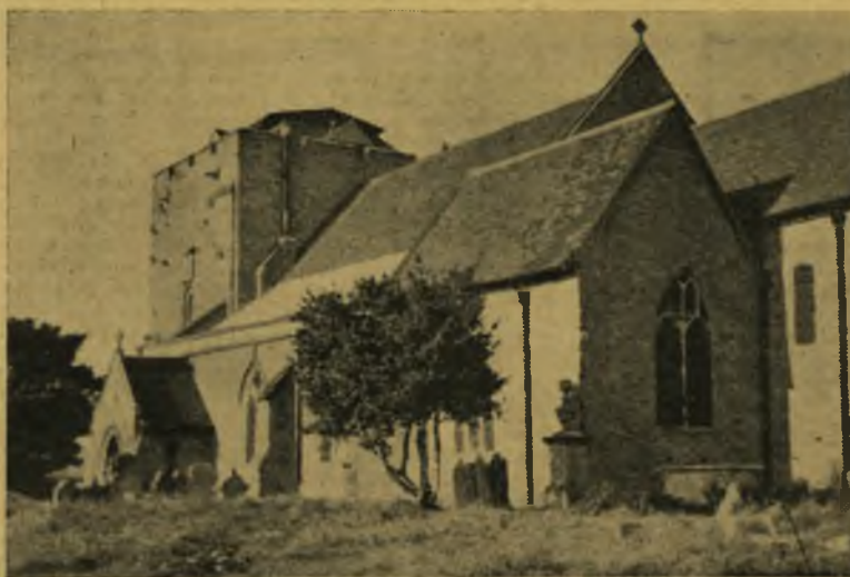
LEEDS PARISH CHURCH.