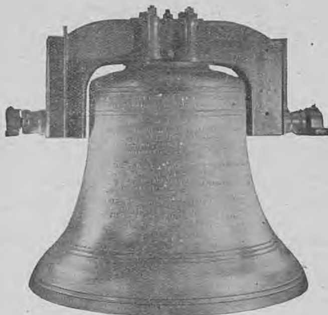
SHERBORNE ABBEY RECAST TENOR. 48 cwt. 0 qr. 5 lb.