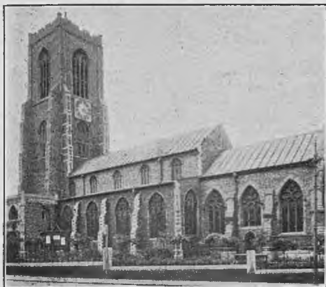
ST. GILES' CHURCH, NORWICH.