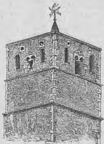
ST. BENET'S TOWER.