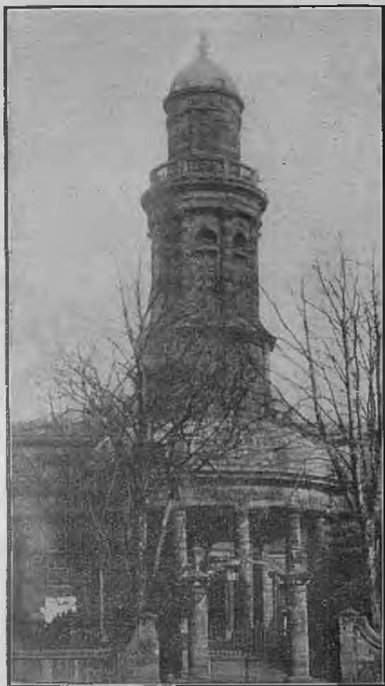
BANBURY PARISH CHURCH TOWER AND ENTRANCE.

Late in the year 1928 the bells were condemned as unsafe and ringing had to be stopped. The restoration needed much anxious consideration on the part of the church authorities owing to the unusual construction of the tower, which is circular in plan. One of the defects of the old peal was that, in order to get all the bells into a round tower, they had not been properly hung in a complete bell-frame, but were hung upon baulks of timber, some of which abutted directly on the masonry of the walls, on which they exerted a detrimental thrust. It was, therefore, decided to adopt the custom, practised in some towers, of hanging the new peal in two tiers. Mr. Ernest Ravenscroft, F.R.I.B.A., one of the diocesan surveyors, who has had a very large experience of belfries and towers, had been appointed the architect to supervise the rehanging of the Banbury bells, and after he had in-