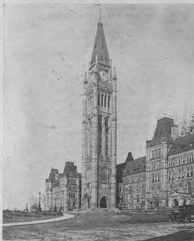
THE VICTORY TOWER Height 300 feet