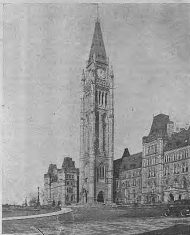
THE VICTORY TOWER Height 300 feet