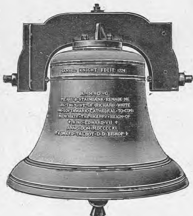
THE TENOR BELL, SOUTHWARK CATHEDRAL, Weight, 50 cwt. 0 qr. 21 lbs.

This bell was recast, and the peal of twelve rehung by us in September, 1911. Since then the following peals have been rung on the bells:—