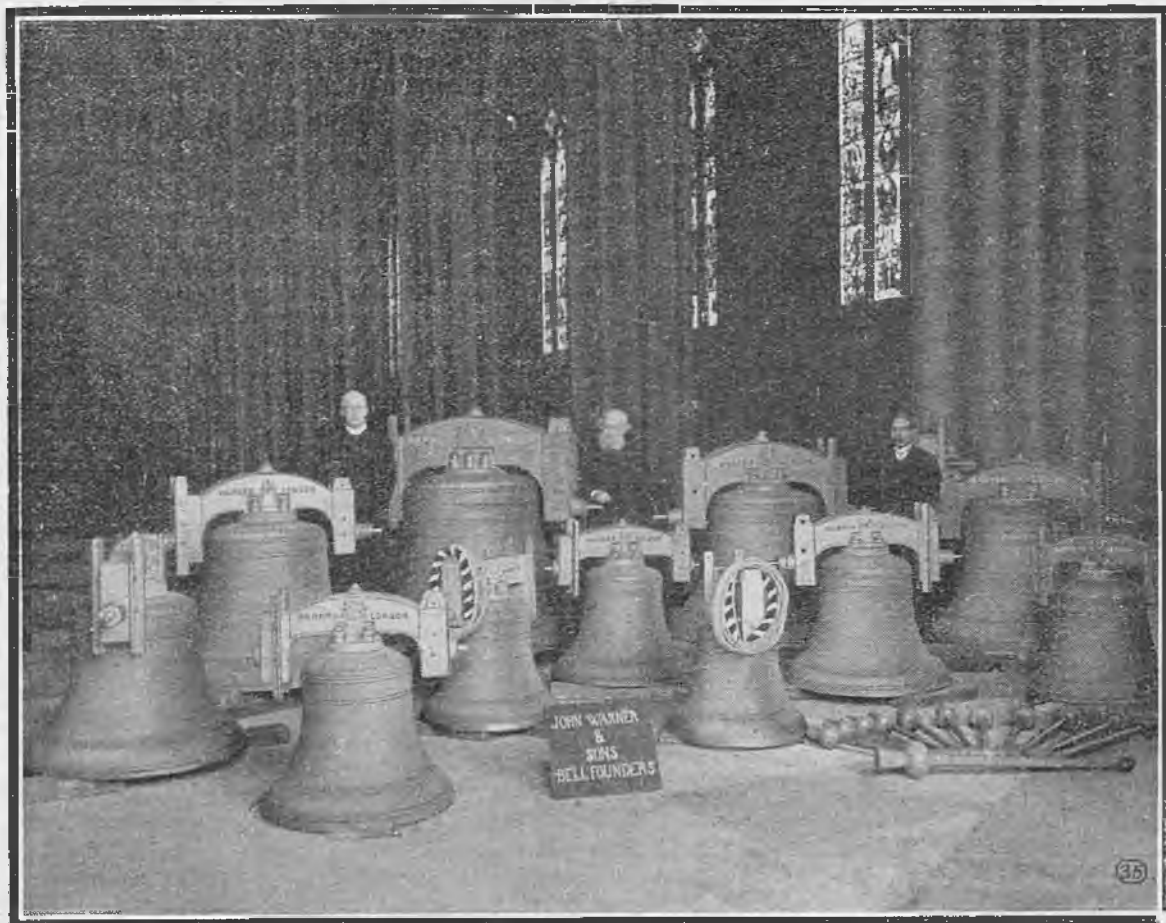
THE BISHOP OF SHEFFIELD AND THE DEAN OF YORK AND YORK MINSTER BELLS, 1914.

MESSRS. JOHN WARNER & SONS, LTD., THE SPITALFIELDS BELL FOUNDRY, LONDON, E.