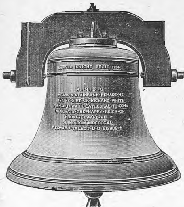
THE TENOR BELL, SOUTHWARK CATHEDRAL. Weight 50 cwt. 0 qr. 21 lbs.

Bellfounders & Bellhangers, 32 & 34, Whitechapel Road, LONDON, E.